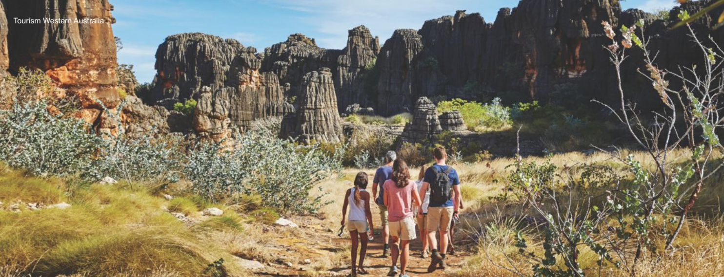
Devonian fossil site