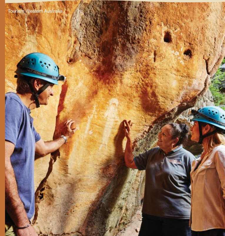
Tourism Western Australia