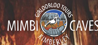
Girloorloo Tour Mimbi Caves Information